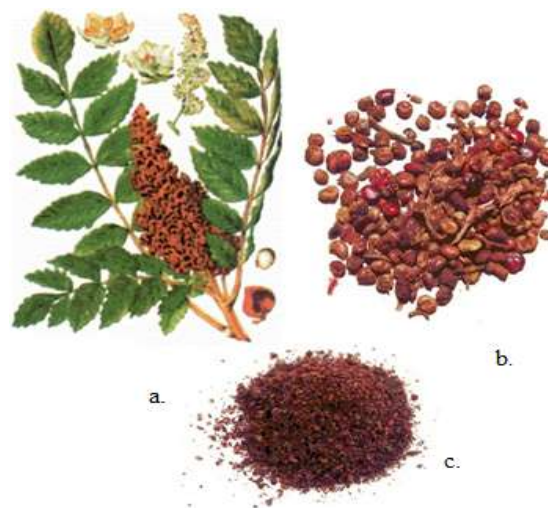
Figure 1. Rhus coriaria L. plant and fruits; a. Sumac plant (leaves, fruits, and flowers) b. Sumac fruits c. Sumac fruit powder.

possesses high fixation, retention and fungal resistance properties, and is useful against wood decay (Sen et al. , 2009). So far, a big deal of nutritionally and medicinally considerable metabolites (such as phenolic acids, tannins, anthocyanins, organic acids, proteins, essential oils, fatty acids, fiber, and minerals) have previously been identified from various parts of R. coriaria (Shabir, 2012).